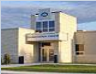
Rainy River District